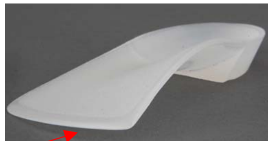
Intrinsic Forefoot Correction Result