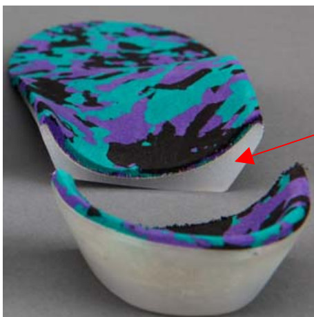
Medial Heel Skive

Inversion is used to increase the medial arch of the device, move the apex distally, and shift the center of the heel cup laterally. The positive mold is balanced with the heel in an inverted position relative to the supporting surface. The clinician can prescribe an inversion from 1 - 10 degrees. In extreme cases it may be necessary to invert more than 10 degrees (up to 35 degrees).